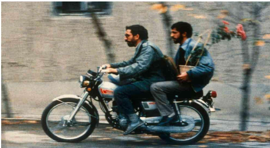
Abbas Kiarostami's docu-fiction Close-Up (1990), starring Mohsen Makhmalbaf.

Into this frame, the frame of preconceptions, entered, for instance, the engineers, film directors, and drifting professionals who drove through Kiarostami's tranquil but earthquake-stricken landscapes, with middle-class children sitting, often, beside them in the car, journeying towards families in houses in remote villages; also in that frame appeared Makhmalbaf's weavers, village primary school teachers, Afghan daily wage-earners, carnival bicyclists.