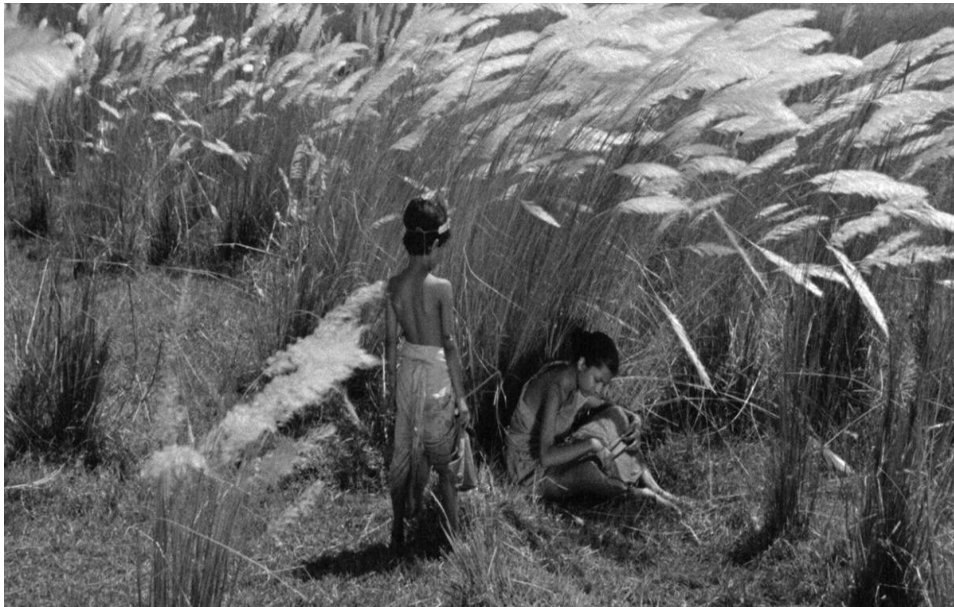
Pather Panchali (1955)

It seems that there are all kinds of unresolved problems to do with Satyajit Ray – to do with thinking about him, with finding a language to speak about him that does not repeat the indubitable truisms about his humanism and lyricism. How does he fit into history, and into which history – the history of India; the history of filmmaking; some other – do we place him first?